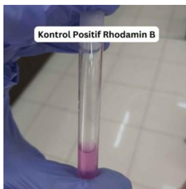
Figure 2. Positive Control Rhodamin B Content Test Results